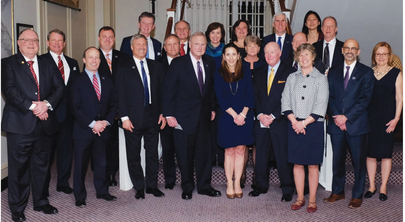
Virginia Law Foundation Fellows Class of 2020